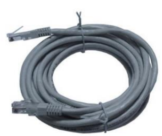
STANDARD ETHERNET CABLE

Description: IEEE802.3 compliant, 10/100 Base-TX RJ45 ethernet port with indicating leds